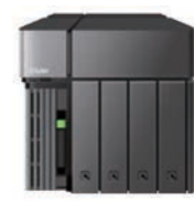
N+1 : Tower 2, 4, 8 Bay

The XCubeNAS series is a next generation, high performance, efficiency and security NAS system which is designed for SMB and enterprise applications. The XCubeNAS operating system is the brand new, and entirely reimagined QSM 3 brings the enterprise level features into the Workgroup and SMB storage. QSM 3 supports comprehensive enterprise-level storage features including SSD caching, thin provisioning, auto-tiering, data deduplication and data compression that transforms the efficiency of every resource to bring you commercial value.