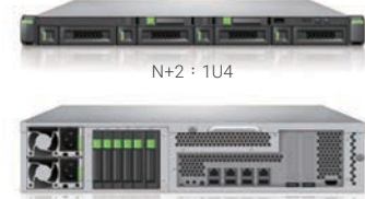
N+4+2(NVMe) : 2U8, 2U12